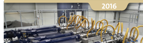
Versailles Wastewater Treatment Plant, France 3,214 tons dry solids per year