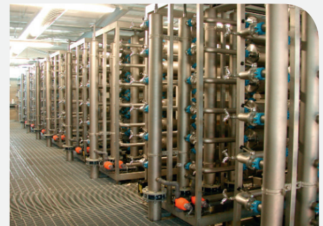
Clay Lane (UK) Installation